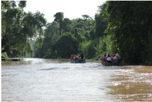
River cruise in Kinabatangan-river