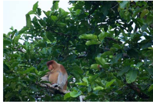
An Proboscis monkey