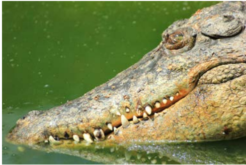
A saltwater crocodile( In crocodile farm)