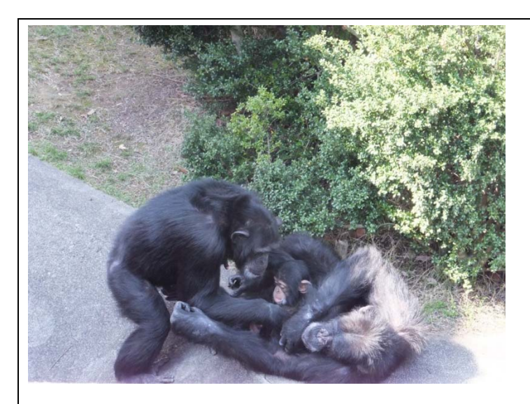
Chimpanzee family is grooming

(Please be sure to submit this report after the trip that supported by PWS.)