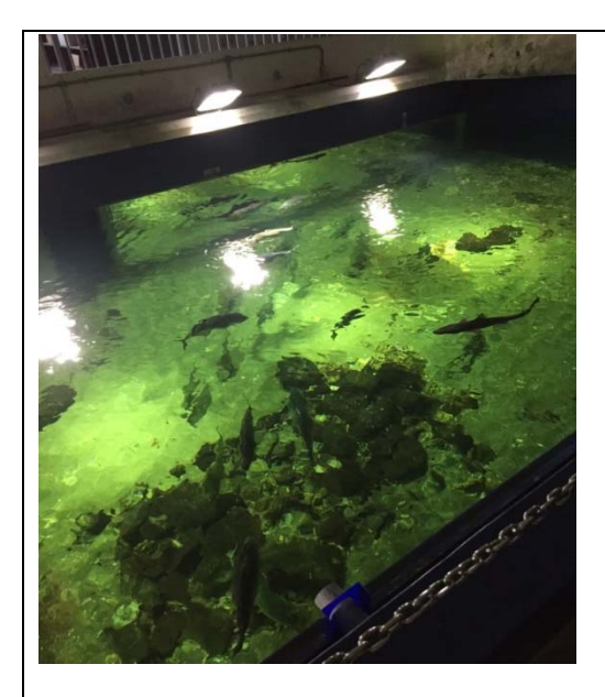
Water tank from backyard of Shirahama aquarium

(Please be sure to submit this report after the trip that supported by PWS.)