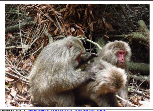
Figure 5: Image showed the Japanese Macaques were grooming each other

Our third objective is to determine the Japanese macaque's behavior in every 5 minutes time interval. We observed and categorized the behavior according to four categories; which were grooming, feeding, resting, and travelling.