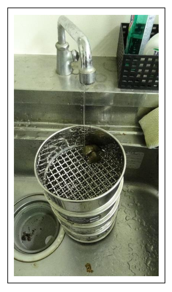
Figure 4: We used sieves to clean the feces and separate between the destroyed feces with intact feces.

(Please be sure to submit this report after the trip that supported by PWS.)