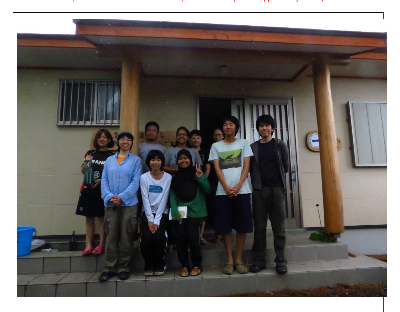
Figure 6: Group picture of Monkey Team

Submit to: report@wildlife-science.org 2014.05.27