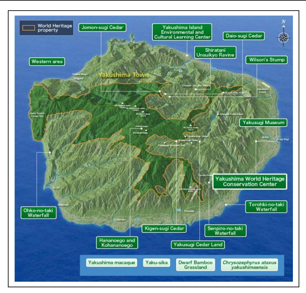
Figure 1: Map of Yakushima Island.

Please insert one or more pictures (to be publicly released). Below each picture, please provide a brief description.