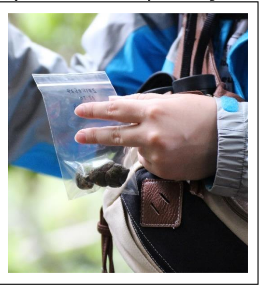
Figure 2: After the feces was collected, we put the samples in the plastic bag. We labelled the bag with the information such as the collection date and hour, location, series number, and information regarding the Japanese macaques (age group and gender).

We were privileged to have this opportunity to visit Yakushima Island for a week. During this visit, I was one of members of Monkey Team. We were divided into two teams; Yamamomo team and DNA team. I was in Yamamamo team, under the guidance of Dr Akiko Takahashi and Mr Yosuke Kurihara. Our first objective is (1) to determine if the Japanese macaques ( Macaca fuscata yakui ) is the seed dispersal or the seed destroyer. To fulfil the study, we have tracked the monkey groups along the Seibu road to collect their feces samples. Diameter of the feces can reflect the body size of the monkey, and we collected the sample to see the ratio content of destroyed Yamamomo seeds with intact seeds. We waited after the monkey has completely finished the defecation process to ensure minimal disturbance. The feces were inserted in a sample bag, and details of age groups and sex of the monkey, location, collection time and date were recorded. In the lab, average diameter of feces was measured by using Vernier caliper. Feces were washed down by using sieves to count the number of intact and destroyed numbers. We also measured the thickness of both intact and destroyed seed by using Vernier Caliper. The hardness of the seeds was measured by using Durometer. Details were recorded in the data sheet and statistically analyzed by using R-Software, by using Generalized Linear Model (GLM). Graph of the GLM was plotted as ratio of destroyed seeds against the diameter of the feces.