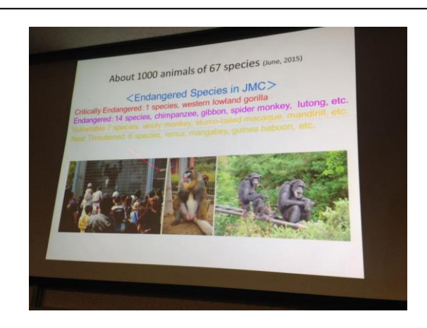
The introductory lecture on JMC