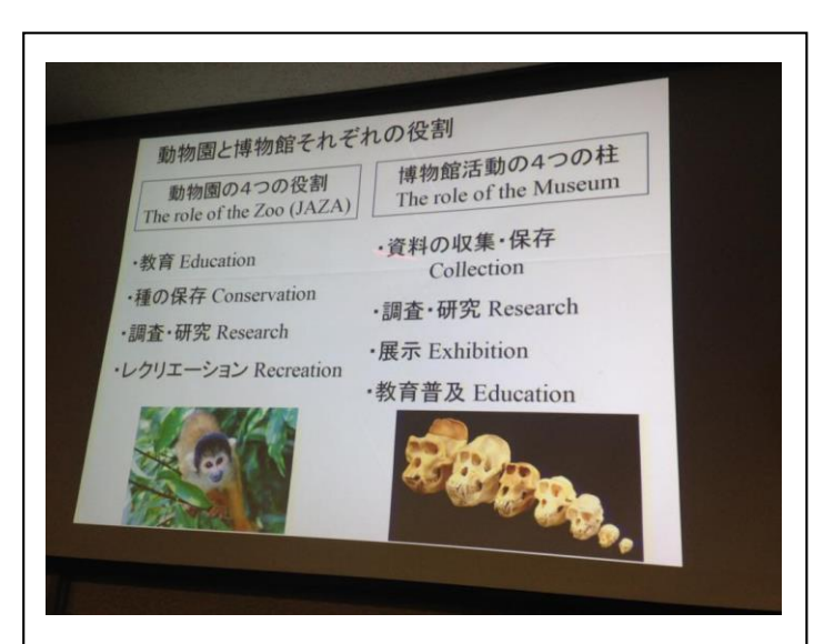
Learning about the role of a Zoo/Museum

Submit to: report@wildlife-science.org 2014.05.27