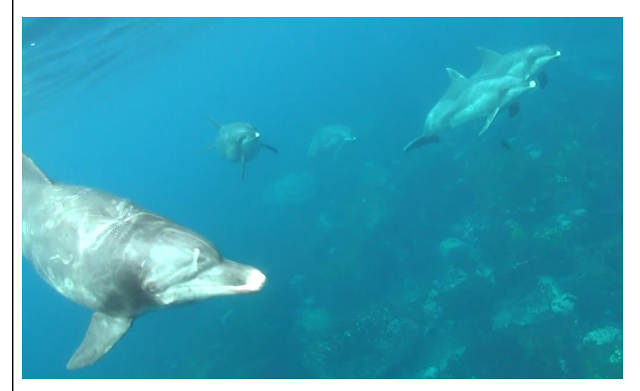
Fig. 3 pair swimming pairs (right side)