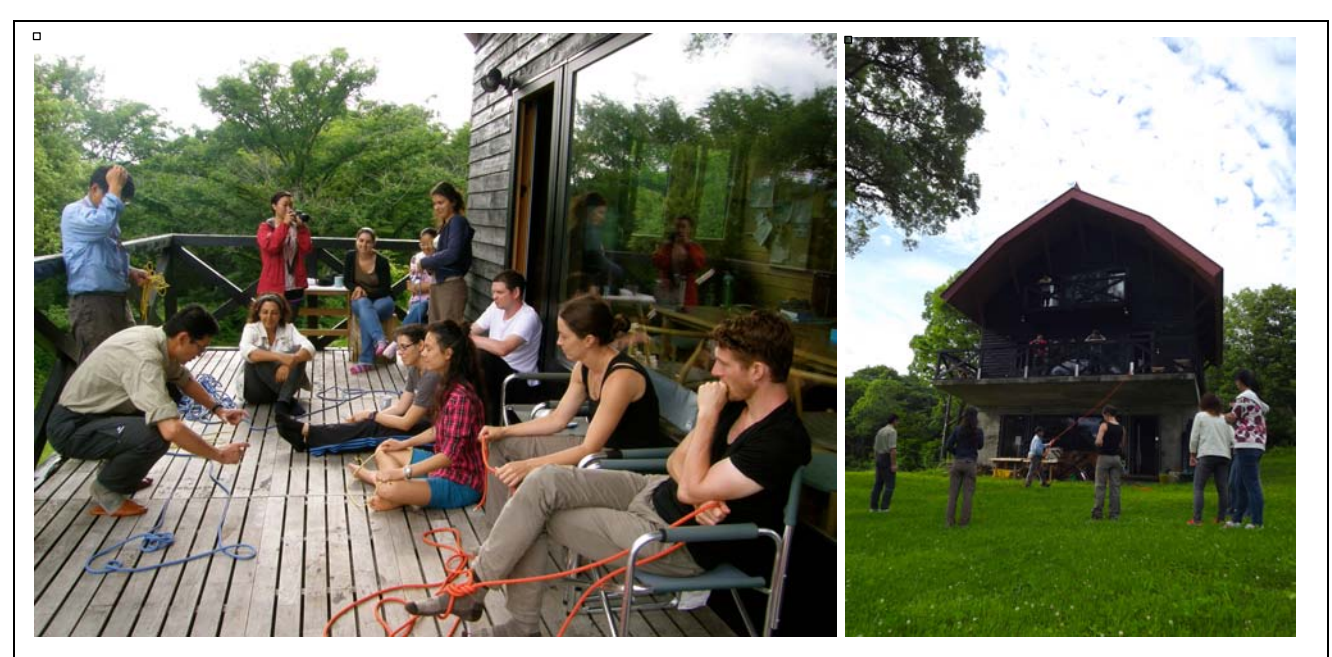
Left: Knot workshop; right: climbing practice