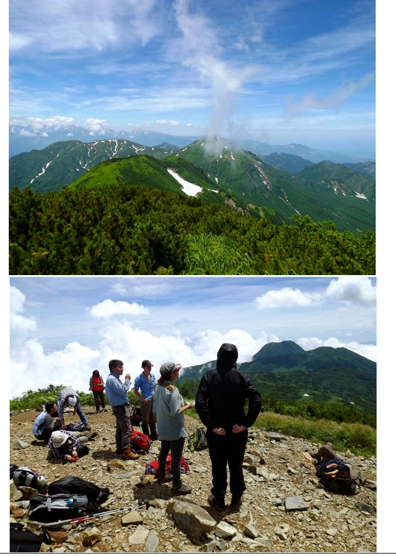
Research Activity Report Supported by "Leading Graduate Program in Primatology and Wildlife Science"