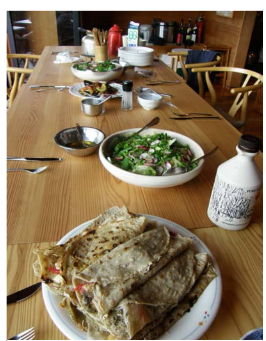
Galettes bretonnes for breakfast. "Survival course"?