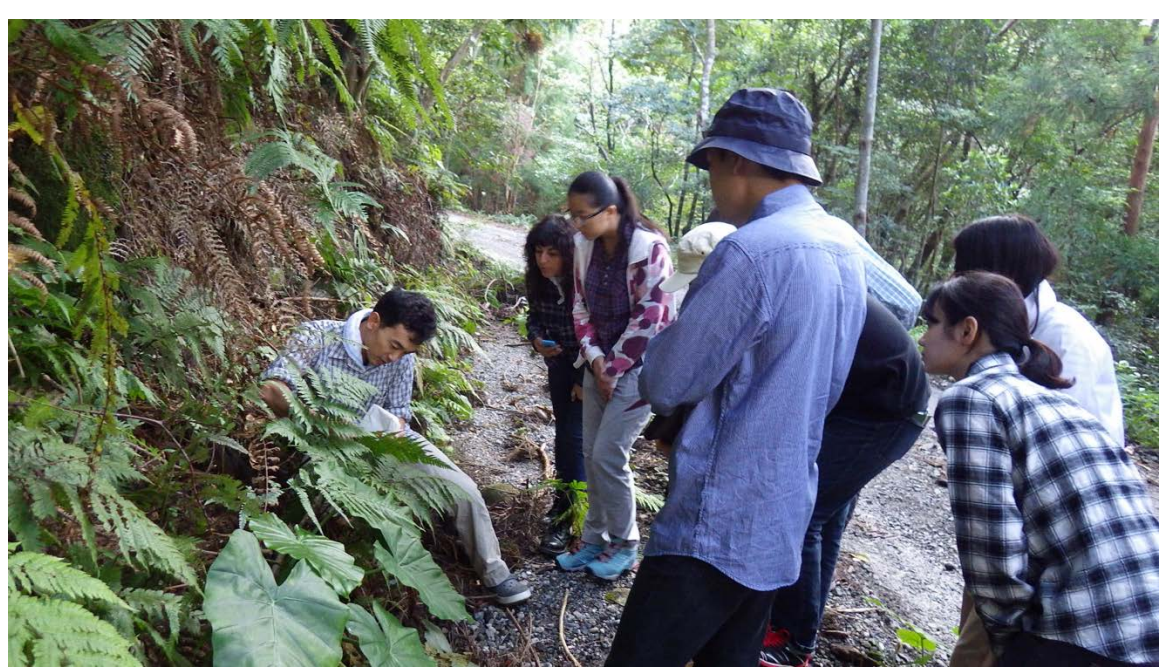
(Learning how to collect sporophytes: to cut in the base part.)