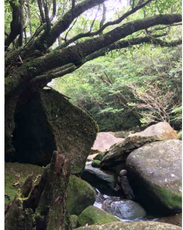
(Sporophyte identification and gametophyte counting. Photo credit: Prof. Kudoh)