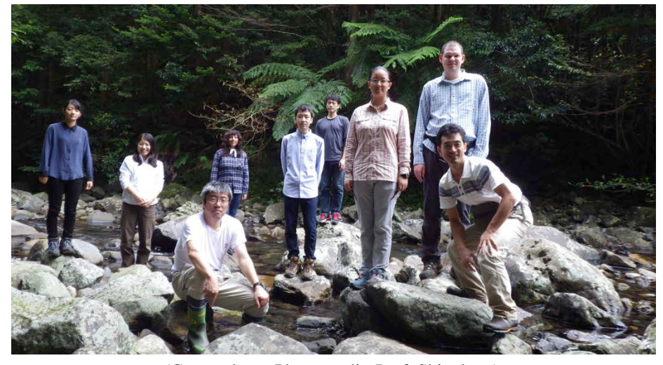
(Group photo.)

Last but not least, almost all work was in cooperation. For the study, we helped each other in collecting samples and laboratory work. For everyday life, we helped with kitchen work and cleaning together to keep our base nice and neat. I gained more experience in cooperation that is essential in future work.