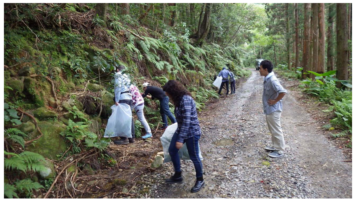
(Collecting sporophytes. Photo credit: Prof. Kudoh)