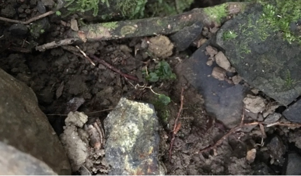
(Learning how to collect gametophytes.) (Where gametophytes (in the middle) live)