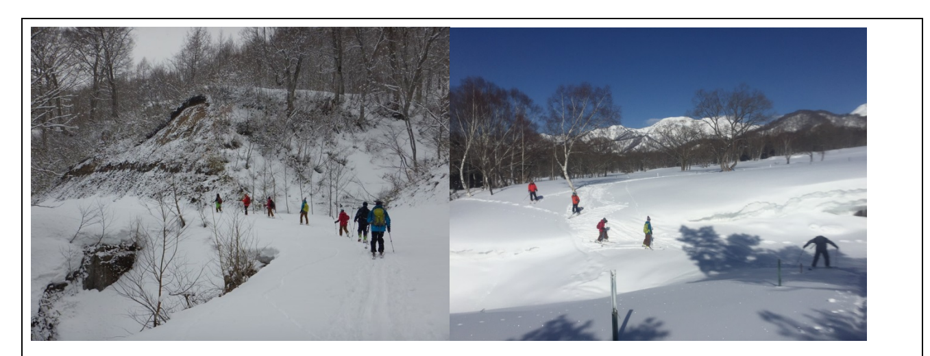
Walk with Ski