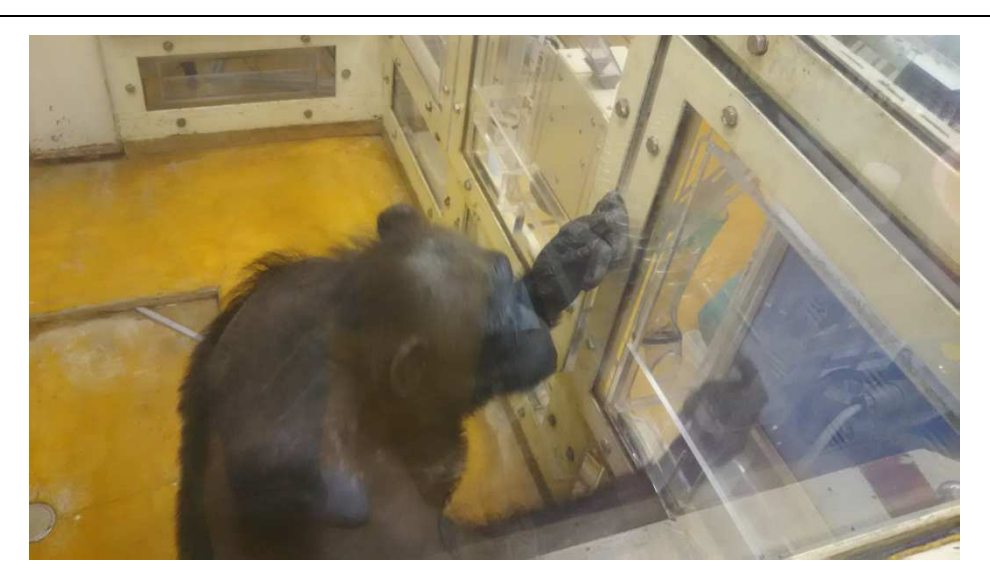
Ai doing her task with touch panel