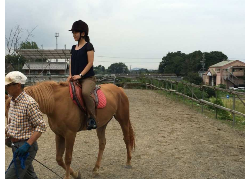
Horse riding

We are doing experiment with horses as well as chimpanzees in horseman Kagamigahara. Little is known about cognition of horses though human and horses have been together since ancient time. How horses, which have about 350-degree view, perceive the world? What they feel actually thought it is often said that they are very delicate animals? The experimental procedures which we use are generalized so we can adapt almost the same procedure to horse and chimpanzees. Actually we are using the same program for number discriminating task with chimpanzees and horses. In the future, more things about horse cognition will be revealed.