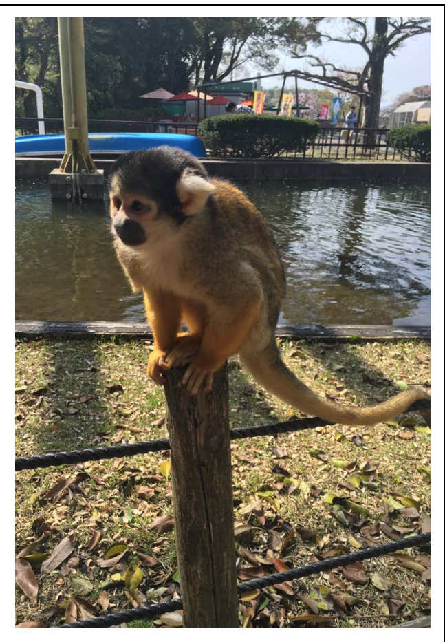
(Japan Monkey Centre)