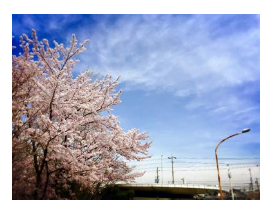
Osaka, Research Reactor Institute