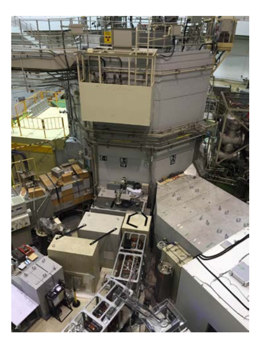
Osaka, Research Reactor Institute