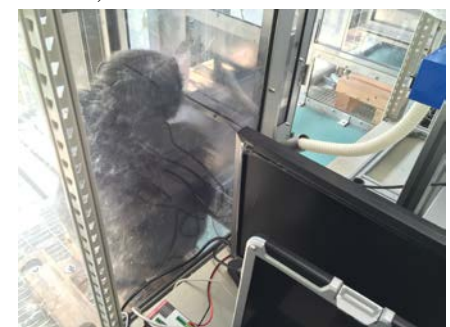
Inuyama, Primate Research Institute