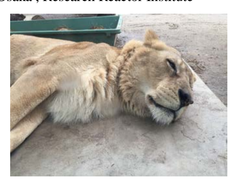
Kyoto, Kyoto City Zoo