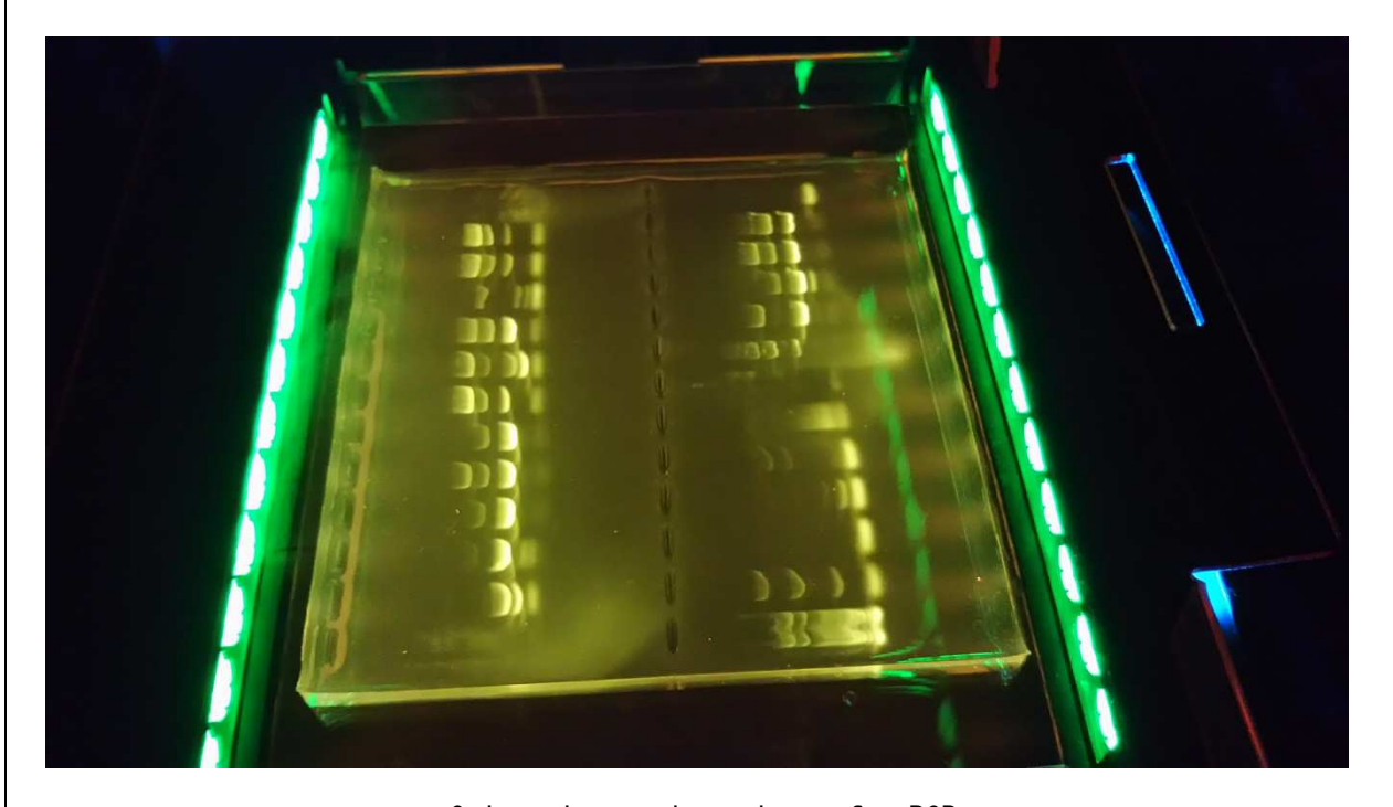
Gel electrophoresis of PCR