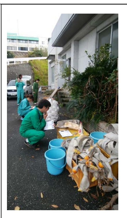
Checks of enrichment tools