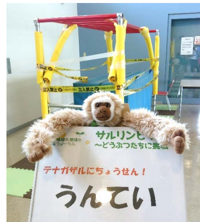
Figure 2. The monkey bar displayed in the workshop. The aim was to let participants to challenge the brachiation skill of gibbons.

This forum provided me with a chance not only to do presentation to general citizens but also to see the effort made by the zoo and the city with my own eyes. Even though the trip was very short, it was so valuable.