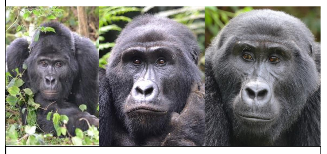
Figure 5-7. Silverback (left) and blackbacks (middle and right) of Rushegura group.

With this in mind, I started my field work by identifying the individuals of a particular group, Rushegura group. The group is currently composed by four adult females, one silverback, two blackbacks, four juveniles and three infants and it is one of the oldest habituated groups – in fact, it was originated during the fission of another group who was habituated in the 1990s and which is still in our days open to tourism activity, Habinyanja.