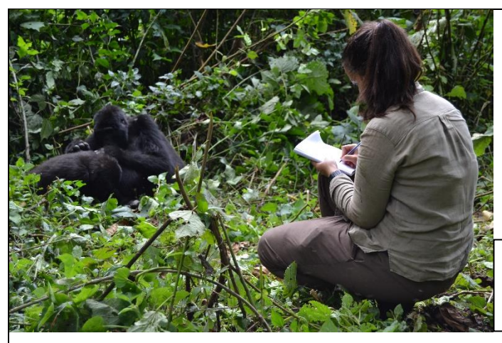
Figure 23. Recording of behavioral data.