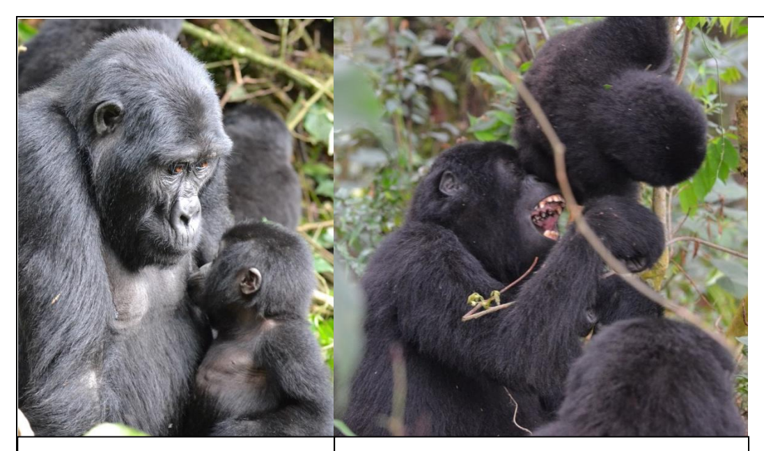
Figure 19. Mother nursing the infant.