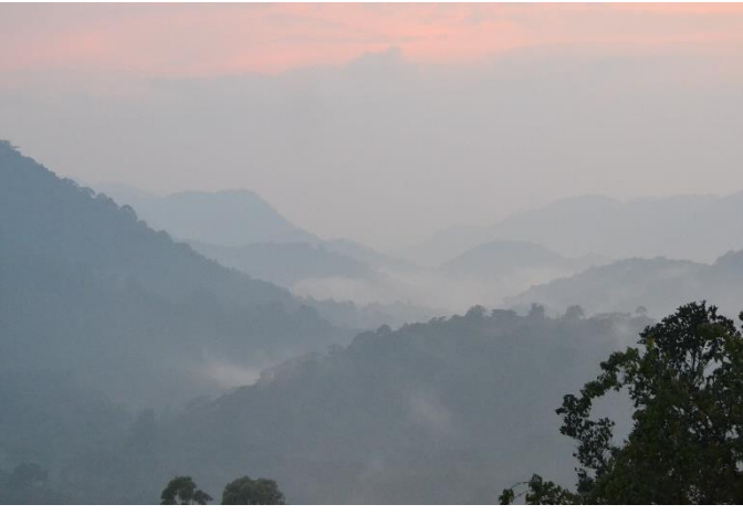
Figure 24. Gorilla Conservation Camp view of Bwindi.