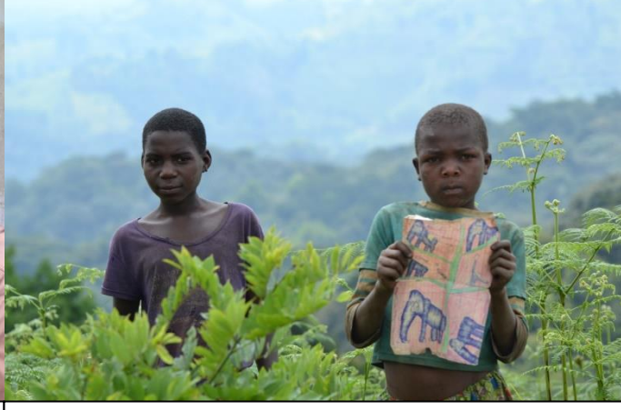
Figure 4. Local children holding gorilla drawing which they sell to tourists after the gorilla tracking.

A good example of CTPH work in the community is the family planning program and general health education of the local community. Such work has to take into consideration the local beliefs and culture. In that sense, CTPH is working in close collaboration with a local healer, who has a special social role within the community. By introducing family planning methods, and "demystifying" modern human medicine practices, it is possible to improve the health and overall life quality for the local population. In addition, CTPH is also developing the "Gorilla Conservation Coffee", which aims to empower the local farmers and spread the Gorilla conservation message worldwide. In this particular project, CTPH is helping people to give up on the unsustainable practices, which depletes the forest resources (wood, bushmeat, etc), and turn to a more sustainable lifestyle with economic benefits, contributing simultaneously to Gorilla Conservation effort. In fact, this species conservation entails significant economic benefits for the human population as