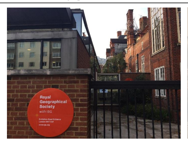
Royal Geographical Society, London