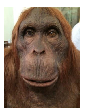
Robotic orangutan from BBC TV Series 'Spy in the Wild' - the right eye is a 4K spy camera

Submit to: report@wildlife-science.org 2014.05.27