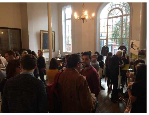
Attendees (around 400 people)