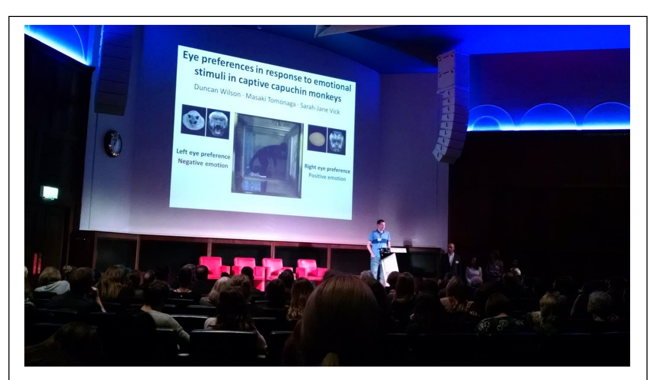
'Fast-fire' poster talk on my MSc research (one slide, 60 seconds)

(Please be sure to submit this report after the trip that supported by PWS.)