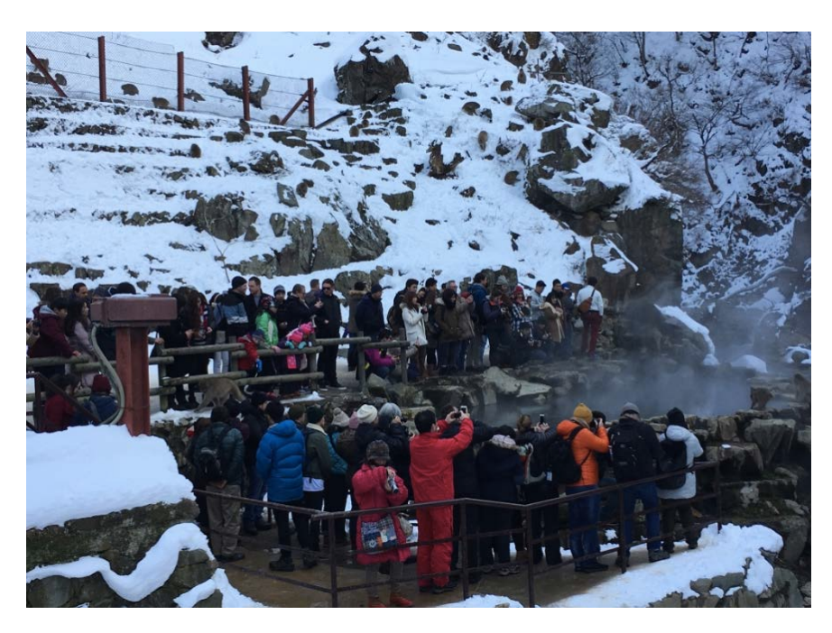
I counted over 160 tourists during my visit.

Jigokudani Monkey Park is located in Yamanouchi, Nagano prefecture. There is a 30-minute walk to the monkey park site from the mountain entrance. The trail was covered in snow and ice (snow footwear is highly recommended). The monkey park relatively covers a large area and monkeys move freely. I counted over 75 individual monkeys with more age & sex diversity of group structure than Funakoshiyama. Monkeys seem in good health and are well habituated to humans. However, perhaps due to the popularity of Jigokudani there were over 160 tourists at the time of my visit. I believe this would be a challenge for an initial saliva study at this site. I've heard from others that the monkeys arrive about one hour before the park opens, so this is one potential strategy for such a study.