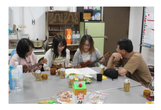
Nothing differentiates a researcher from a hunter, a cook, or a musician.