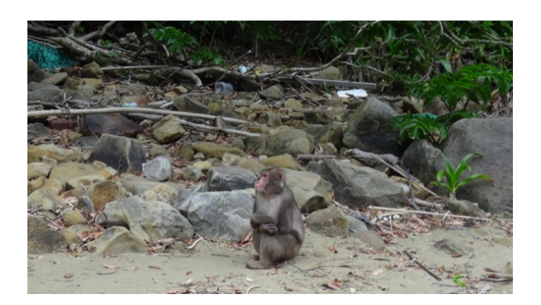
Alpha male Shika was showing a boss-like pose.