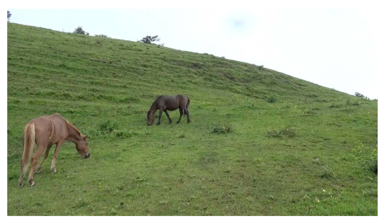
Step-formed food marks made by horses of Cape Toi.