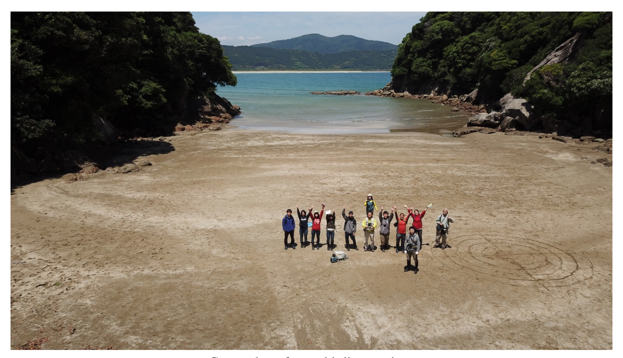
Group photo from a bird's-eye view.

Submit to: report@wildlife-science.org 2014.05.27 version