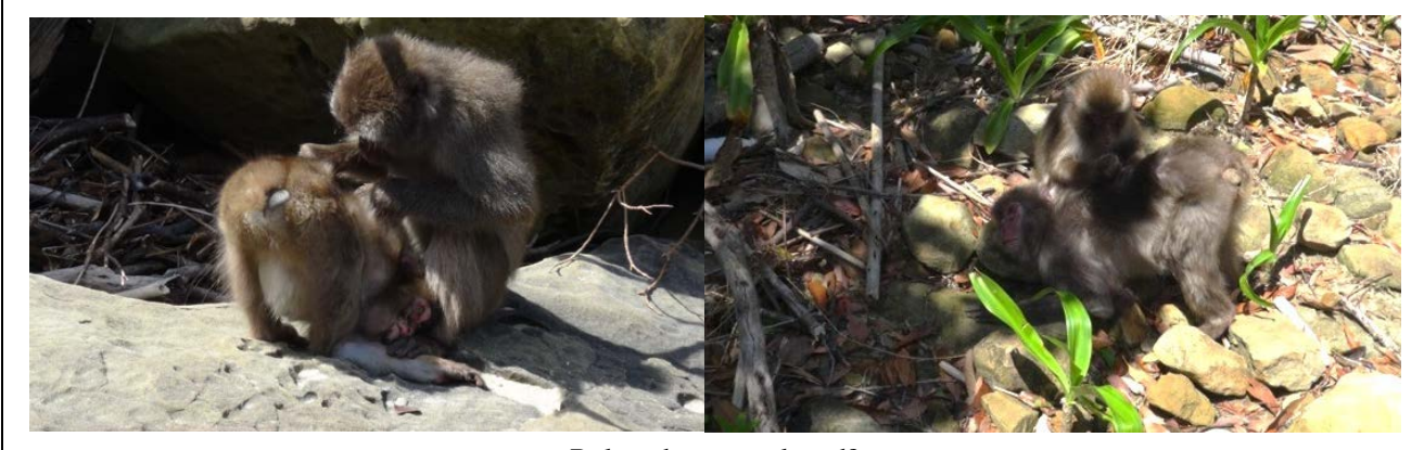
Relaxed or not relaxed?

2014.05.27 version Submit \ to: \underline{report@wildlife\text{-}science.org}