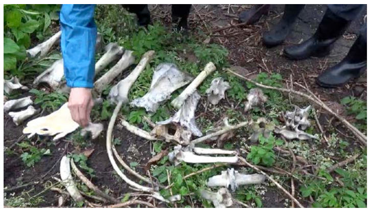
Improvised lecture hold by students, who are expertise in fecal sample analyzing and morphology.

Submit to: report@wildlife-science.org 2014.05.27 version