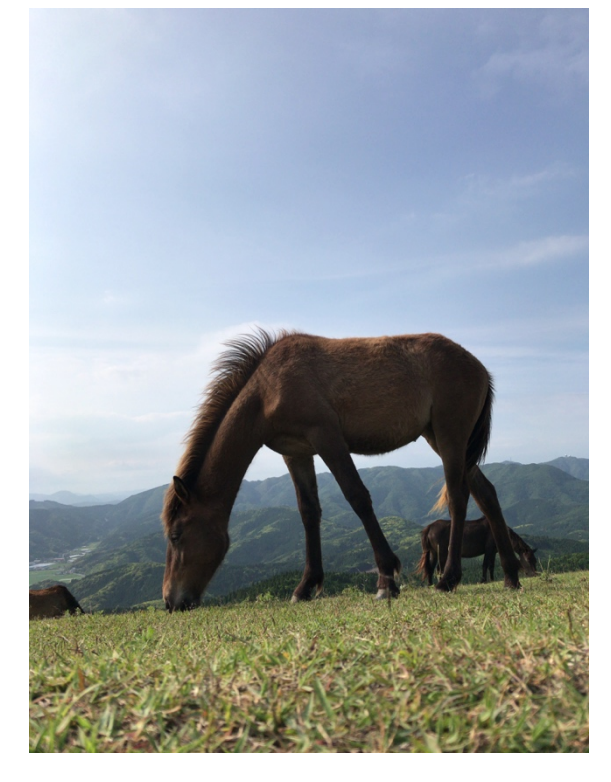
Fig 2. Feral horses in Toi cape