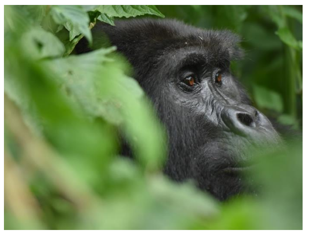
Photo3. Kbd (AdF) in R group