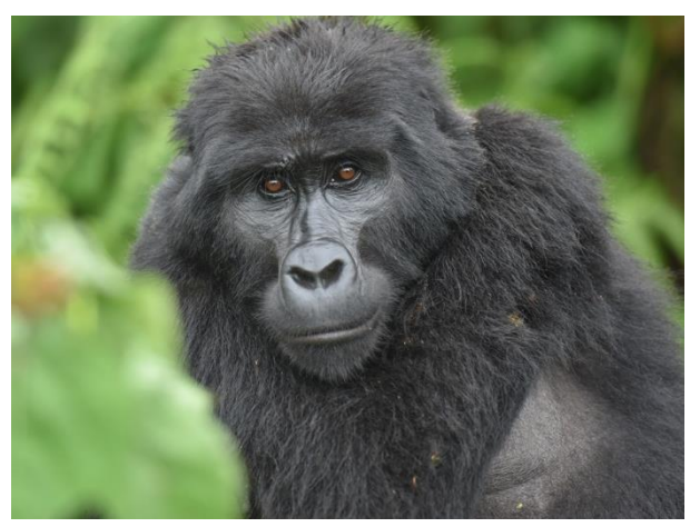
Photo2. Mnn (AdF) in R group