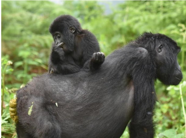
Photo4. Infant feeding on mother's fresh feces