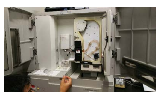
A next generation sequencer