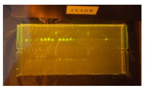
Day 2 result of electrophoresis experiment