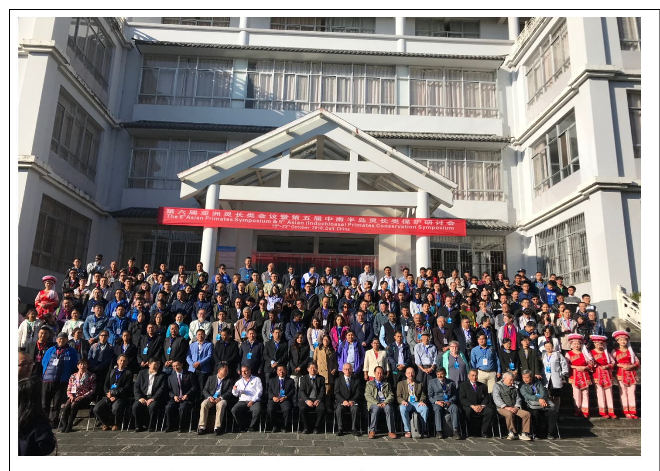
Group photo of 6th Asian Primates Symposium and 5th Asian primates conservation symposium