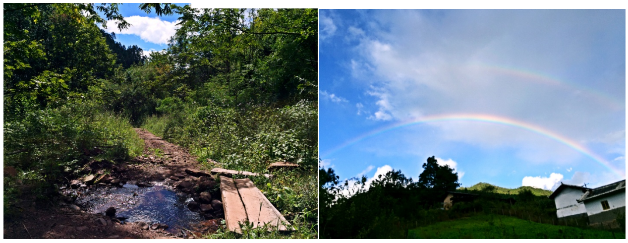
Liju village at the foot of Laojun Mountain