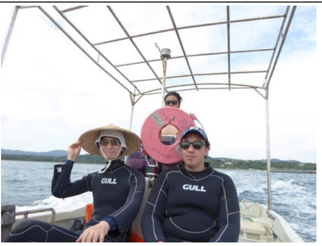
On the way to predetermined snorkeling spots.