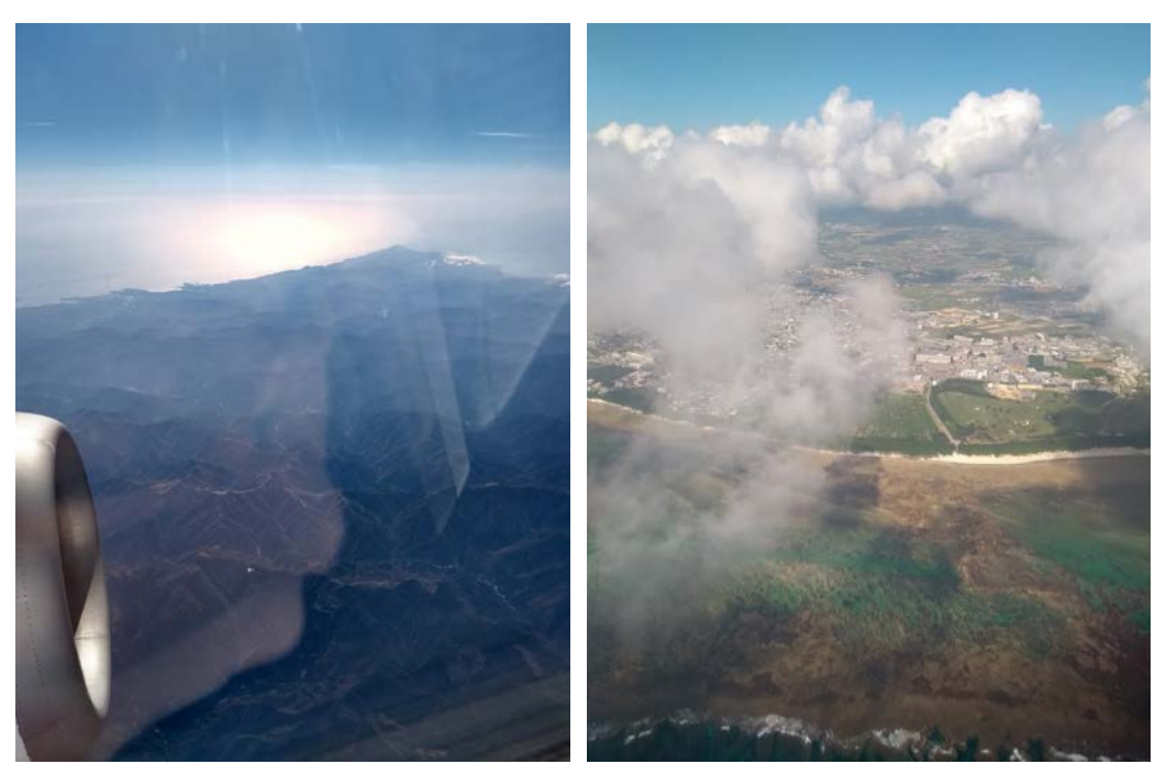
Beautiful views on the way there.