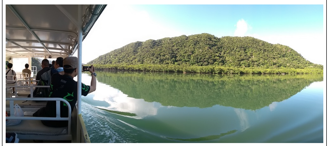
Boating up the Urauchi River through mangrove forests