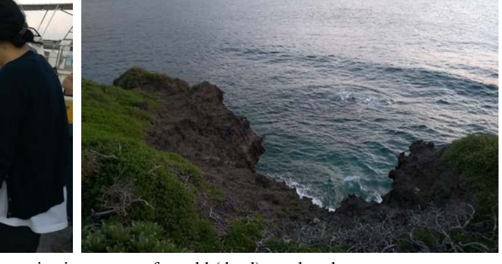
Evening fishing and sunset viewing on top of an old (dead) coral rock.