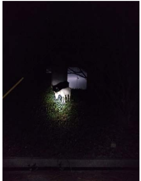
On an afternoon walk past some bushy and soft looking trees, and during an evening walk in search of the Iriomote cat we instead stumbled upon a domestic goat.