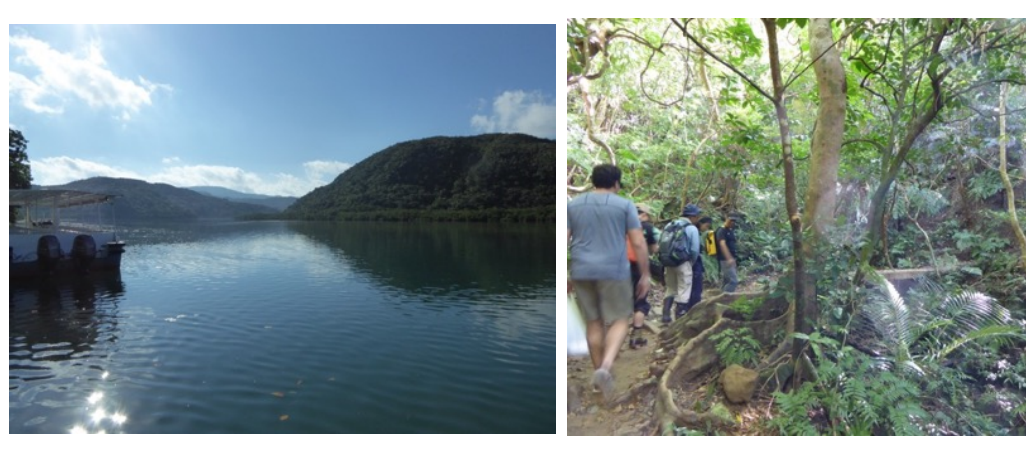
Another view from the boat. Hiking past an impressive buttress root.