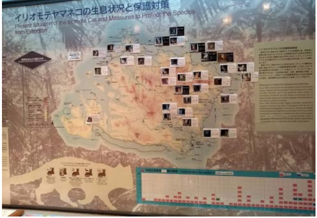
A taxidermy Iriomote cat and a map of their current status.