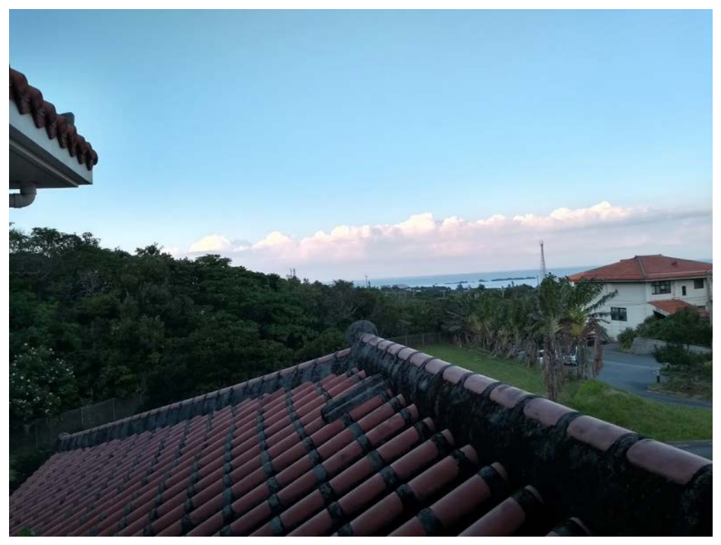
View from our University of Ryukyus home in Iriomote.