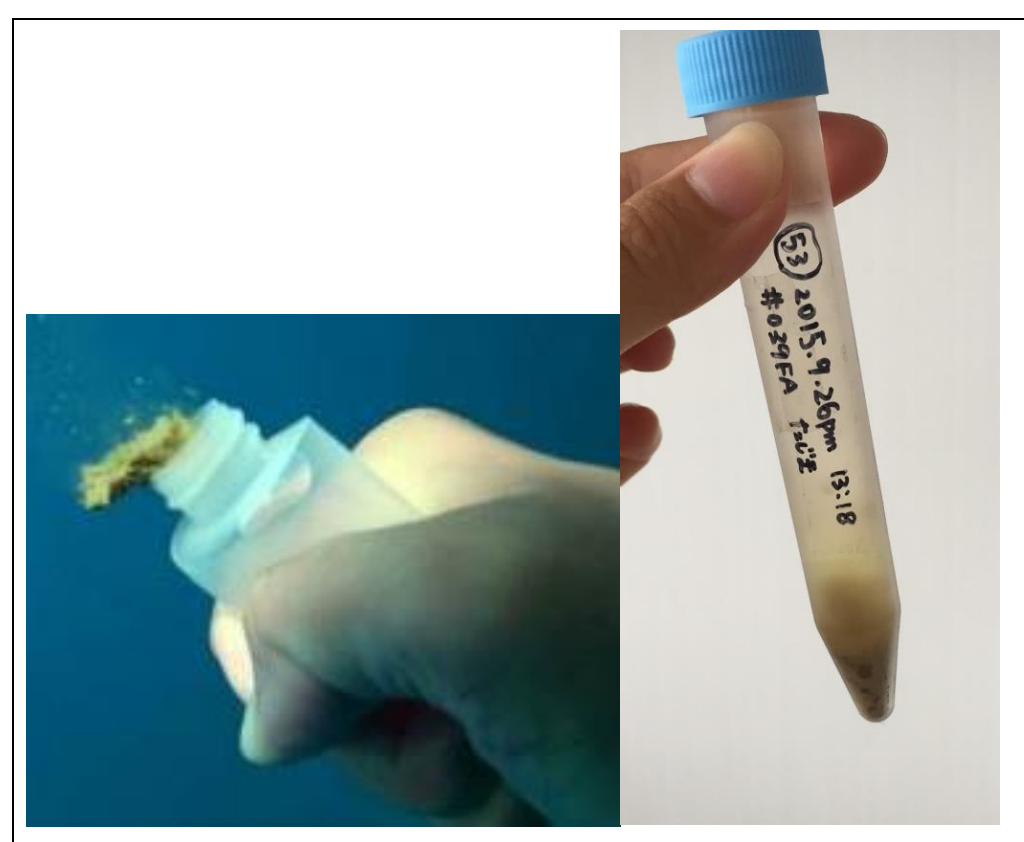
Fig. 3 Getting feces and fece sample

(Please be sure to submit this report after the trip that supported by PWS.)