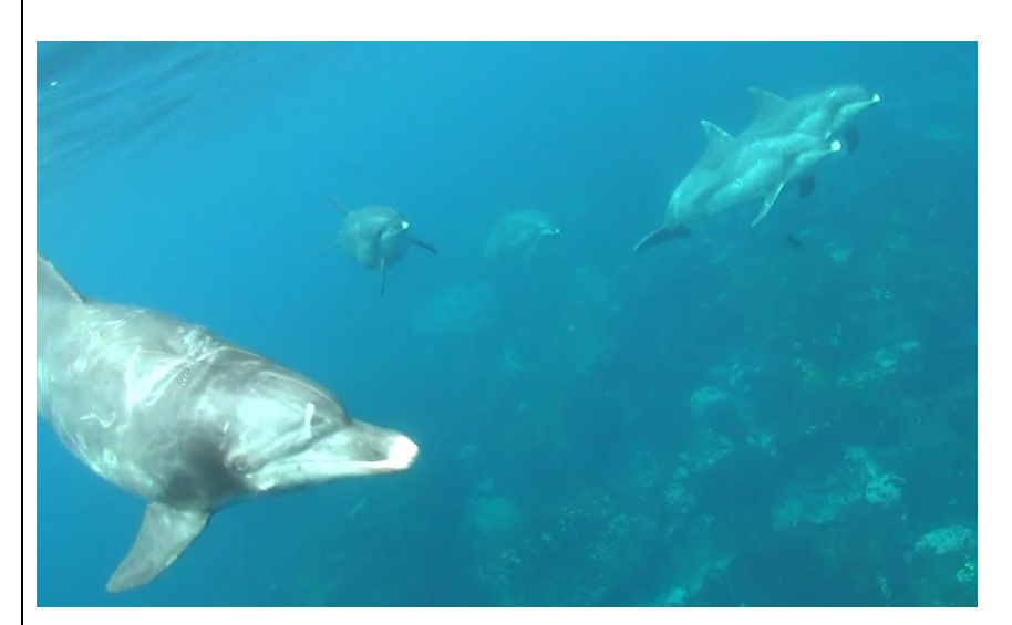
Fig. 4 pair swimming pairs (right side)