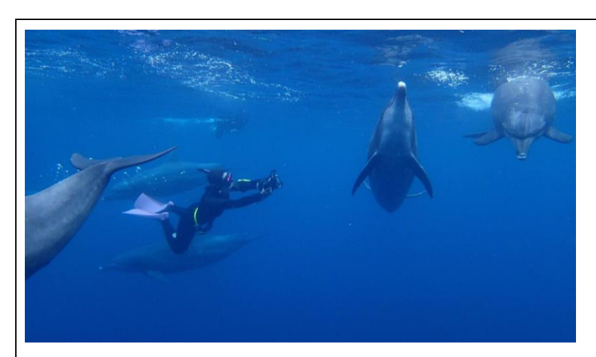
Fig. 1