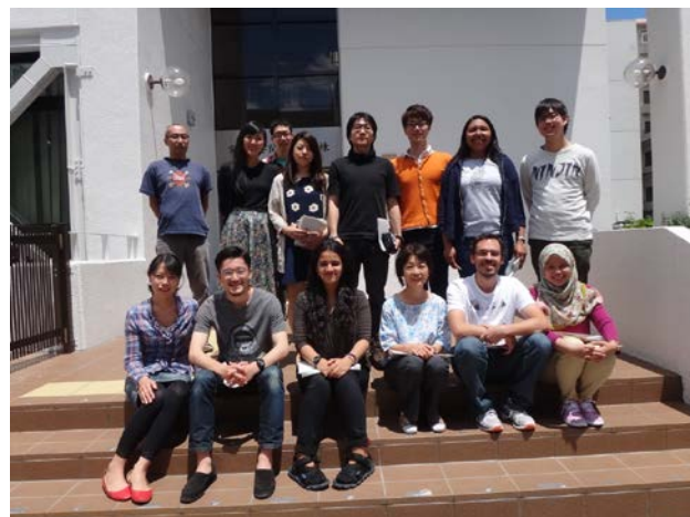
Figure 3. Group photo of Genome Science Course - deer group 2016