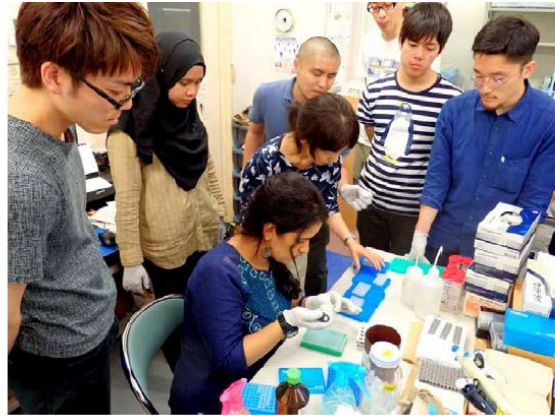
Figure 1. Preparing the samples for DNA extraction and