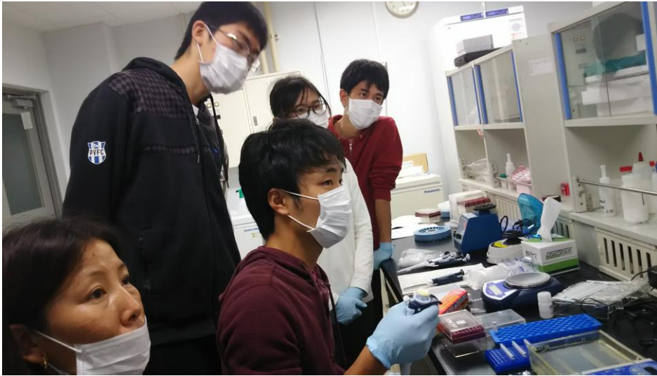
Listen carefully how can we do the analysis