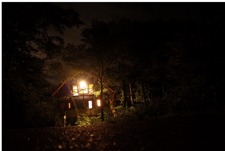
Sasagamine Hutte in the night