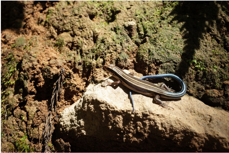
Japanese five-lined skink