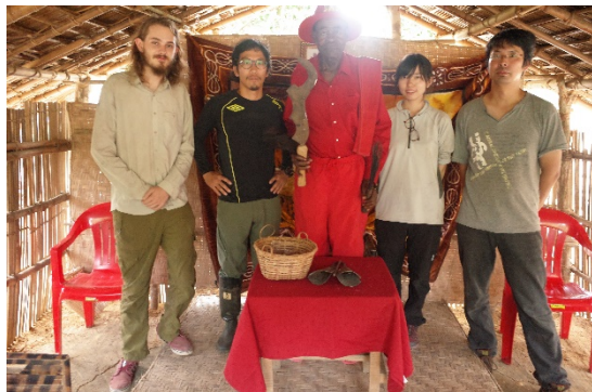
Meeting with local chief at Nkala village the end of our time in the field