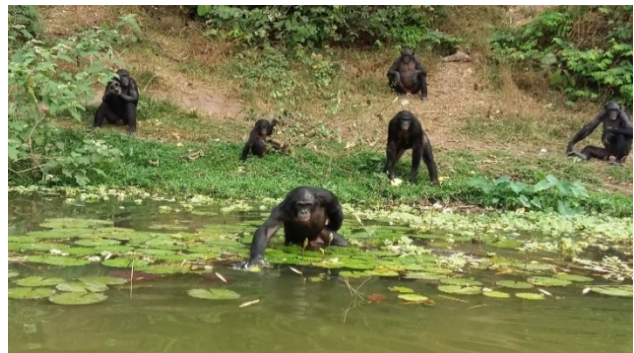
Feeding time at Lola ya Bonobo, where bonobos happily wade through water to get fruit