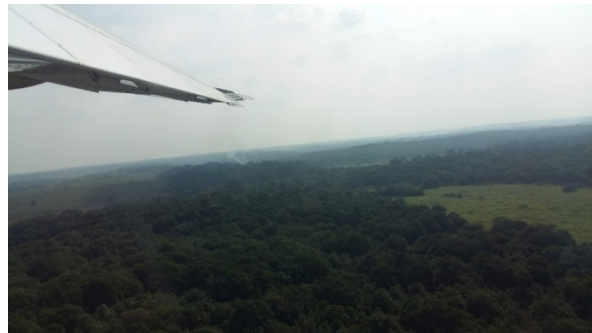
Aerial shot of forest-savanna mosaic as seen from air on our way back to Kinshasa