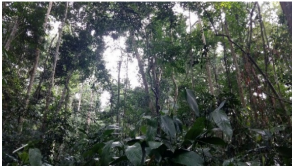
Forest as seen from ground in typical day following bonobos

Overall it was an incredible experience to be able to see bonobos in their natural habitat, especially in such a unique environment, learn about the complex relations involved in their research and conservation, and continue to get insights from experts as I observed and throughout the journey.