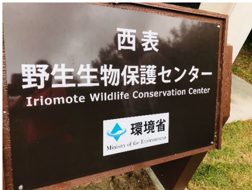
Iriomote Wildlife Conservation Center