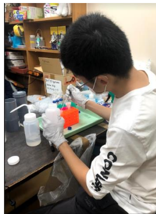
Preparation of samples