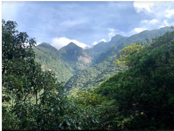
Landscape of Yakushima