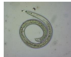
Nematode found in soil