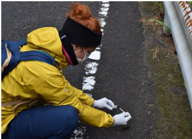
Collection of monkey fresh feces on the road