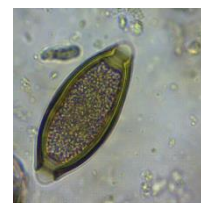
Trichuris found in macaque feces