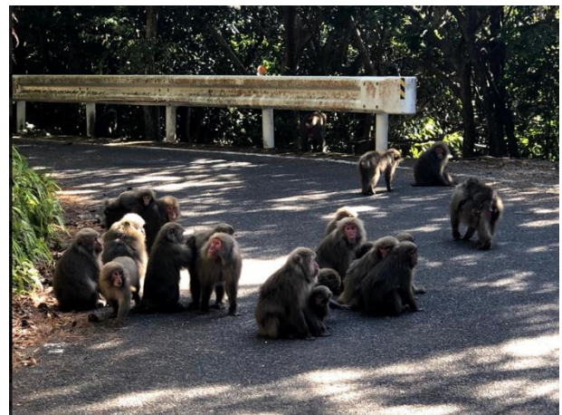
Group of Yakushima monkeys on the road