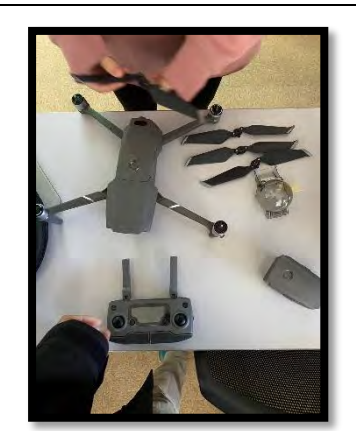
Fig. 2: Understanding the mechanisms of drones.

After lunch, we had another drone flying session outdoors with autopilot systems where we started off with the lectures and guides. This part was fascinating because we learned how to plan a flight path for the drone in advance, which is essential for ensuring that the drone captures the right data in a specific area. We then put that knowledge into practice, flying drones outdoors and testing out our flight plans. It was fascinating to see the drones automatically fly towards the selected point and act as instructed that we had preset prior to flight such as capturing photos or recording videos.