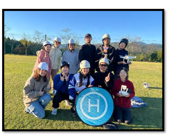
Fig. 5: Successfully operated drones safely outdoors.