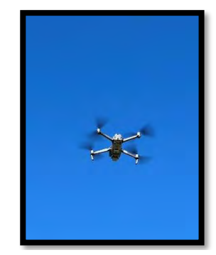
Fig. 3: Hands-on experience navigating drone outdoors.